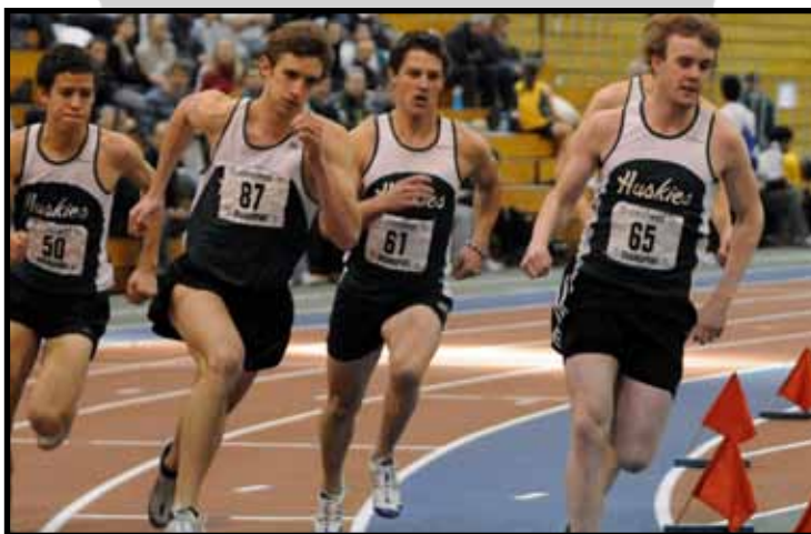
Huskie athletes have been successful in the mid-distance races.